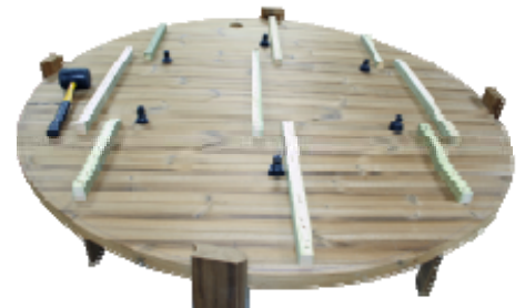
The connections are pressed/screwed onto the