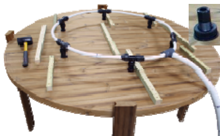
The air valves are screwed into the base

The base of the bubble system for the HT150 has 6 holes for air vents, which are screwed into a lower part (see picture). This is suitable for T-connections that are connected to an air hose. Note! Use Silicone or an equivalent material to seal the base of the jet from above as well as the threads. Tighten by hand. The picture below illustrates the connected hose system (Basic).